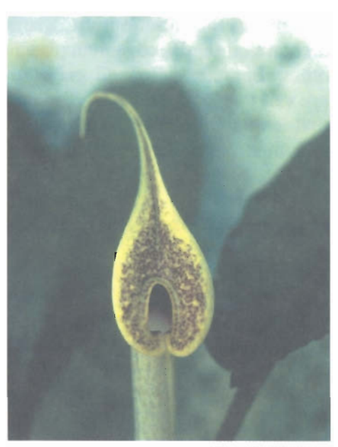
1b. Limb of the spathe of Cryptocoryne xtimahensis .