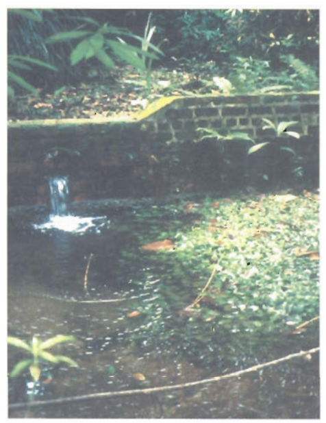
1a. Dammed pools on the Jungle Fall Stream in the Bukit Timah Nature Reserve, Singapore.