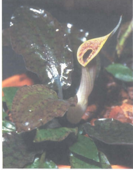
1c. Cultivated plant of Cryptocoryne xtimahensis.